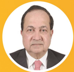
Mr. N. Ram Chairman The Hindu Group of Publications